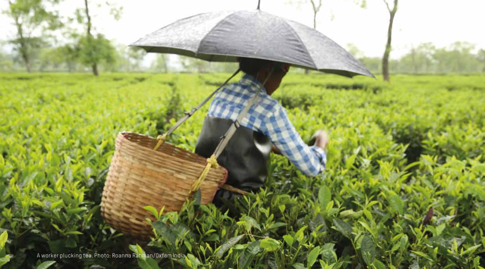
A worker plucking tea.

The root cause of this crisis is a historical legacy of injustice for Assam's workforce, coupled with an inherent inequality of power, meaning that supermarkets and tea brands can exert an ever-greater price squeeze on the estates that supply them with private label and branded Assam tea.