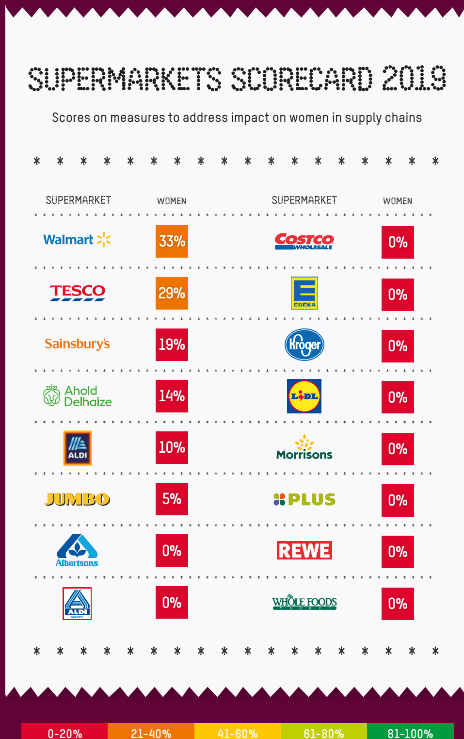
FIGURE 4. GENDER SCORES IN OXFAM'S SUPERMARKETS SCORECARD (2019)

Note: Scores are based on an assessment of measures taken by supermarkets to address specific human and labour rights impacts on women in their food supply chains. Scores are given based on publicly available information measured against a set of indicators of recognized good practice. Percentages given are the points scored as a percentage of the total score available on the women theme of Oxfam's scorecard for 2019. Full data and methodology is available here: https://policy-practice.oxfam.org.uk/publications/behind-the-barcode-supermarket-scorecard-2019-data-620836