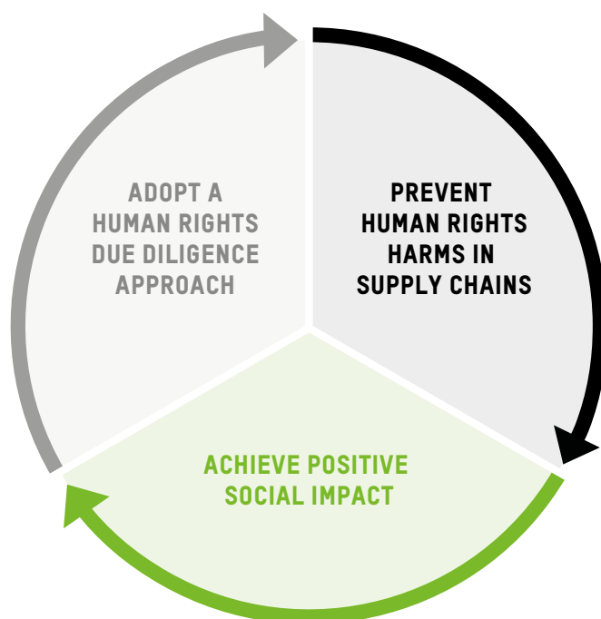
FIGURE 1. SUPERMARKET ACTION TO IMPROVE WORKERS’ RIGHTS IN FOOD SUPPLY CHAINS

Given these developments, companies will only face growing pressure to demonstrate how they are addressing workers’ rights issues. To help them, Oxfam has released a framework with clear and actionable recommendations for supermarkets on workers’ rights.