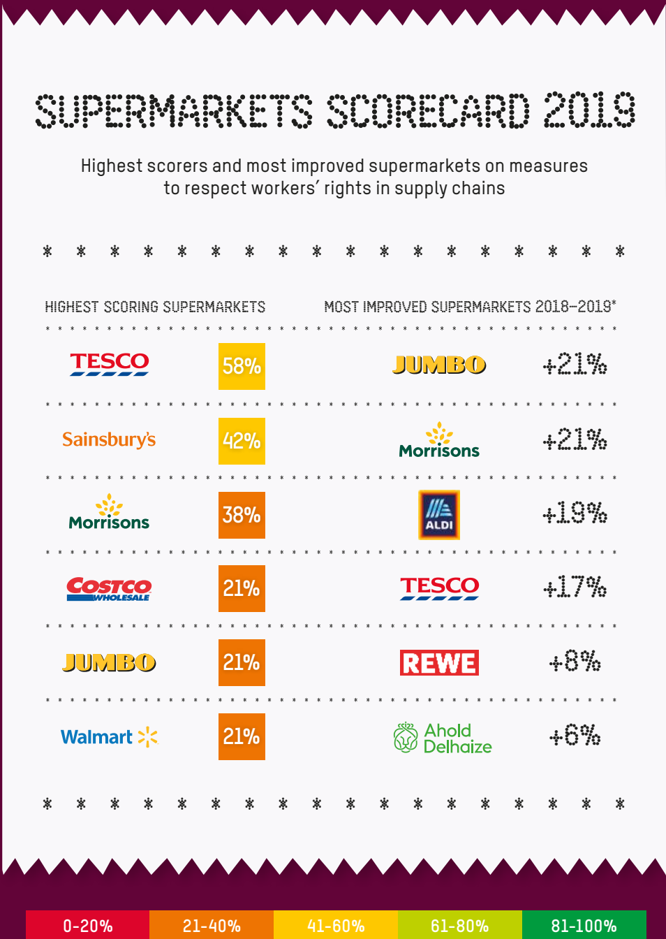
FIGURE 5. HIGHEST SCORERS AND MOST IMPROVED ON OXFAM'S SUPERMARKETS SCORECARD (2019)

*Based on change in score on workers' rights from 2018-2019 in percentage points.