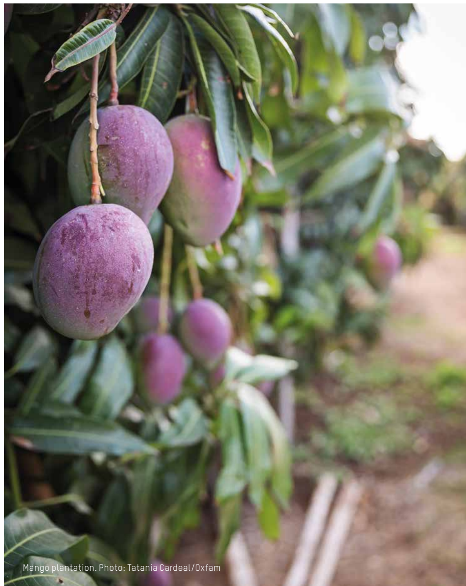
Mango plantation.

However, the performance of half of the companies in Oxfam's scorecard remains woeful. ALDI North (0), Edeka (0), Whole Foods (4), Kroger (4), Lidl (6), Albertsons (8) and Rewe (8) all have workers' rights scores that are less than 10% against Oxfam's benchmarks of good practice, while others such as PLUS have failed to improve over the course of the year.