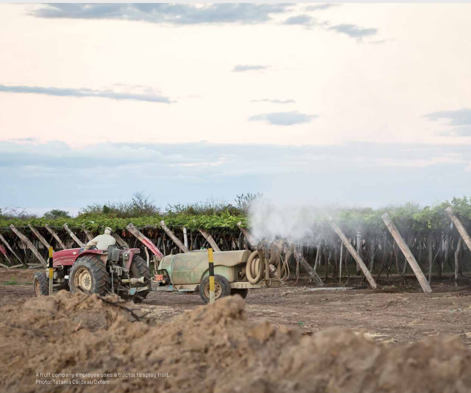
A fruit company employee uses a tractor to spray fruit.