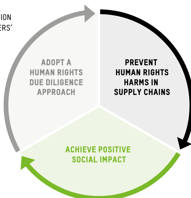
FIGURE 6. SUPERMARKET ACTION TO IMPROVE WORKERS' RIGHTS IN FOOD SUPPLY CHAINS